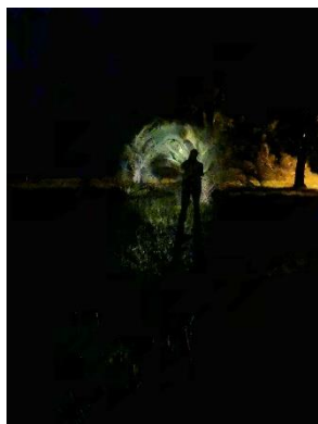
This is not contrived nor photo shopped, just a moonlit night.