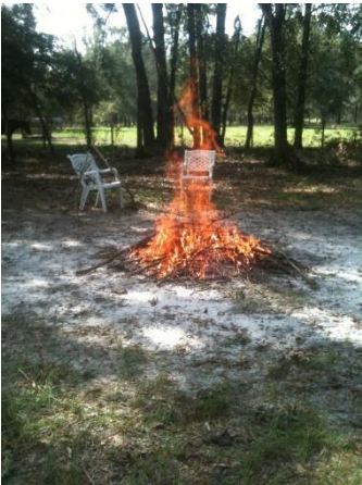
We love you, Fire Horse. May the Heavens be set ablaze by your Playful Spirit.....

Please consider donating to Wil-Hee's Rescue Fund, click "Save the Animals" on our website: www.EquestrianSpirits.ORG . All proceeds go only to the animals, as our board is unpaid.