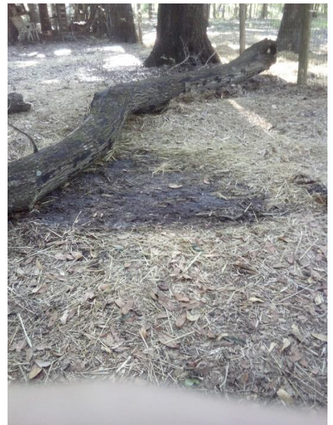
proof we dragged it!!

On a lighter note, I was informed by one of our residents, who is much smaller than a horse, that "little beings are also very important! With this in mind, here are a few 'tiny moments' at Amik Run, the home of Equestrian Spirits non-profit. Enjoy!