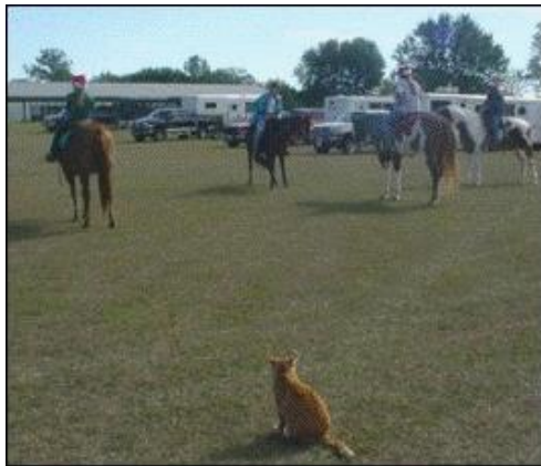
putting on a horse show

Picture #1 is Bradli explaining to an FEI level Dressage Thoroughbred that they are not scary critters, at all! These two became great friends but moments before this picture was shot, the horse was coming 'unglued'. A patient, quiet rider subdued his mount's reaction & the donkey did the rest. #2 is Bradli's life-mate Brooke, together now, well over 20 years. The spotted couple (fondly called "The Spotz") are mother & child, inherited when we initially bought the farm.