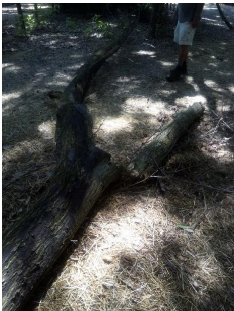
oh, what to do... what to do

This morning brought an unexpected challenge. A huge limb began to sever itself during last year's storm season. It was almost magical how it set itself into an adjoining tree. Seeing no imminent danger, we left it to nature's plan. Today was the day the limb decided to go. More 'magic' because it dropped without damaging our fence, gate, or a coop! However, it did lay across a pathway needed for feeding horses. Lo & behold, Moose & Laurie are still not too aged to move a 2-ton log (mild exaggeration – lol). I wonder what June will bring!