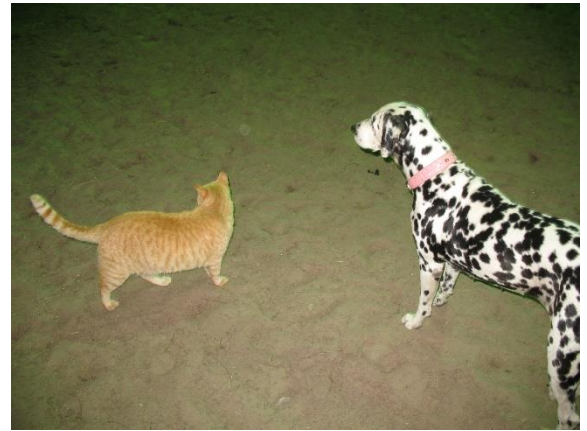
teaching jumping lessons! AH-HA

There were some great guesses who the cute upside-down kitty was in our last issue. Thank you for participating! His name is Ahandhi & he was (obviously) our horse kitty. In 2003, we hosted a Bowen Clinic. In between other critters, a student asked if it would help a cat. Ahandhi was part of a feral rescue & had remained aloof with no fear, but with no use of humans... until that day. The short version is, his (& our) entire world changed that day. See for yourself, what wonders a great veterinarian, loving family & some Bowen can do. Look for Ahandhi's story – soon to be added to our website.