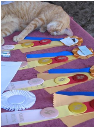
in between classes