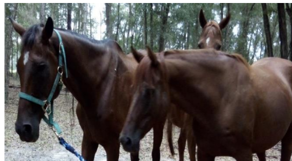
mother with 2 of 3 daughters