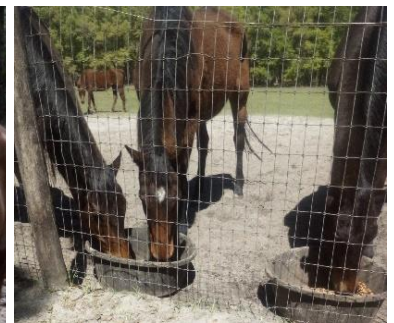
Muzyk, mate, & best friend