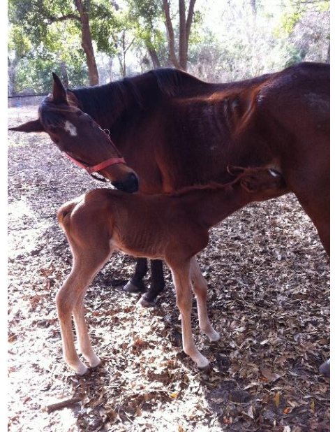
2011 "my new little girl"

mare #1 : we had a lame, thin mare donated who had a 2-month-old filly by her side; mare #2 : the following fall we had an emaciated mare donated & when her vets found out she was pregnant, they gave up all but the smallest of hope. (keep reading, please – this is not a tragedy...). Next: mare #1 was 29 years old when we had to close out her life due to advanced cancer. Almost to the minute, 12 hours later, mare #2 gave birth, immediately adopting the now motherless yearling, as her own.