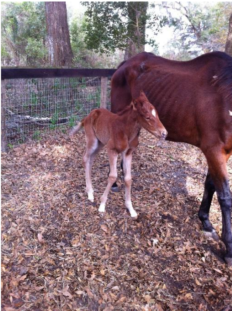
1 st day of sunshine