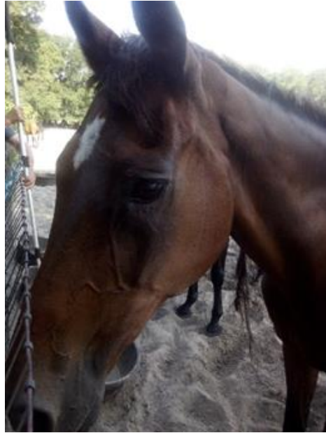
a youthful look for 26